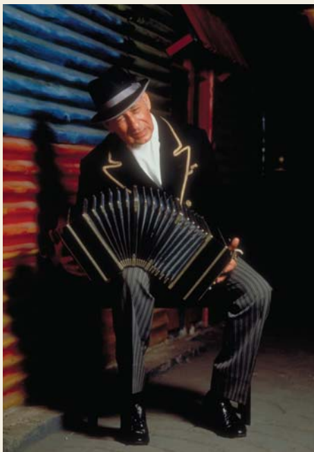
Bandoneón player, Buenos Aires

Arrive in Rio and get settled into your hotel. This afternoon you will ascend the summit of Sugarloaf Mountain via a breathtaking cable car ride. Afterwards,