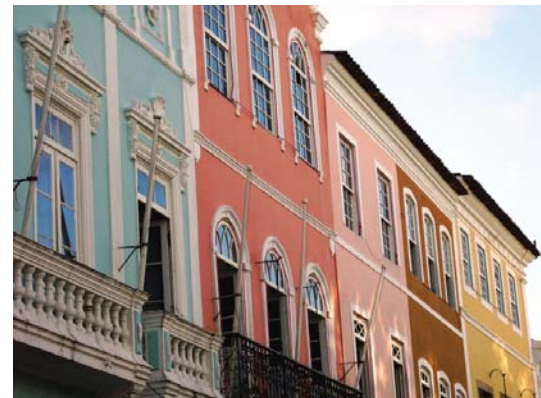
Pelourinho, Salvador da Bahia

Today you will fly to Brasília, one of the world's most modern capital cities, and check into your room at the luxurious Blue Tree Park, adjacent to the President's residence, the Palácio da Alvorada . (B)