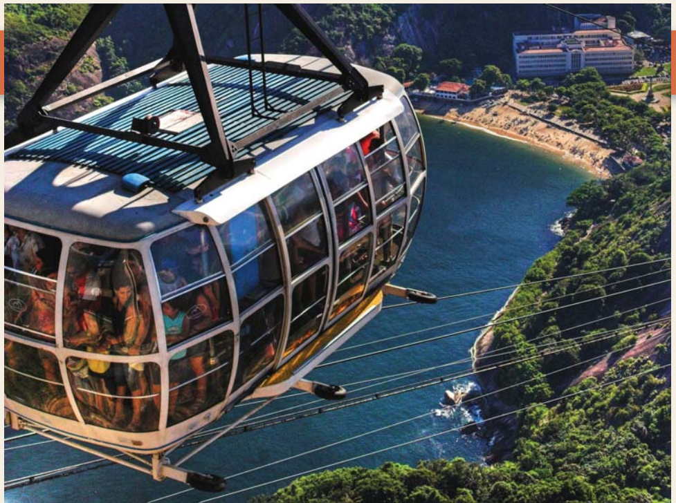
Sugarloaf cable car